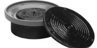
Series 410-20-23* (with closure plug)