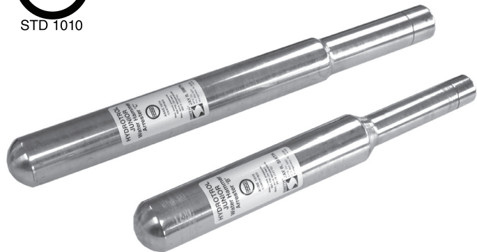
Sweat Connection Piston Water Hammer Arrester Series 520-SC